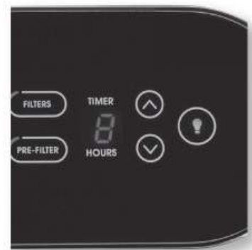
Fig. 5 Timer Function