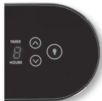
Fig. 6 Dimmer Function

NOTE: The Power (symbol) and the Bluetooth (symbol) icon will always remain illuminated.