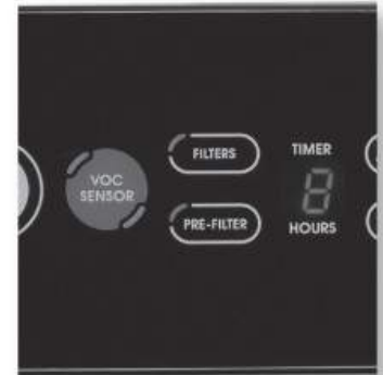
Fig. 9 Will illuminate when it is time to change HEPA filters

You should periodically check these filters. Depending on operating conditions, the True-HEPA filters should be replaced every 12 months, and the Odor Reducing Pre-Filters every 3 months, especially if there have been heavy odors and particles in the home.