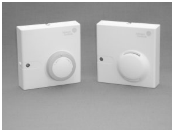
Figure 1: HE-6800 Series Humidity Transmitters with Temperature Sensor

The HE-6800 Series Humidity Transmitters include screw terminal block terminations that provide flexibility for field wiring. All models include a 6-pin modular jack access port for connecting accessories to the Zone Bus. This feature allows a technician to commission or service the controller via the transmitter.