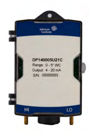
Figure 1: DP140 Series Transducer

The Johnson Controls® Low Differential Pressure Transducer DP140 Series offers an excellent price-toperformance ratio and meets the requirements in all typical HVAC applications. The DP140 is a low differential pressure transducer that uses a dead-ended capacitive sensing element and requires minimal amplification. The DP140 delivers ±1% full-scale (FS) accuracy with ±0.25% and ±0.5% accuracy options with pressure ranges from 0.1 in. W.C. up to ±25 in. W.C. The DP140 has a small footprint and an AC power option.