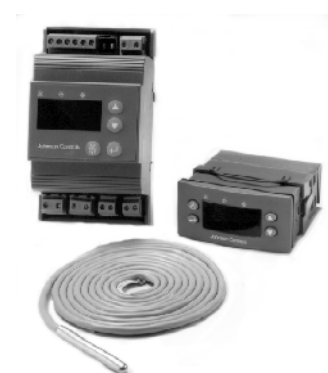
MR4 Series DIN Rail and Panel Mount Modules