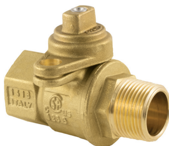
MIP x FIP