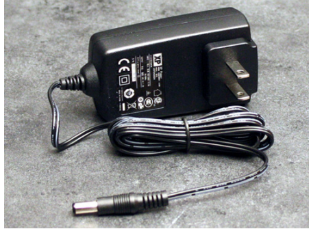
Power Supply PSWA-DC-24