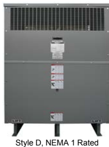
Style D, NEMA 1 Rated

Special outdoor construction required for NEMA 3R applications. Contact your local Schneider Electric sales office for details.