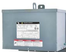
Type T and Type TF