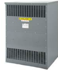
Style J—Type 2 Rated Converts to Type 3R with Weathershield