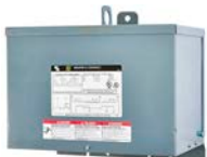
Style C—Type 3R Rated