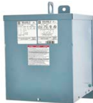
Style B—Type 3R Rated