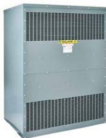
General Purpose Dry Type 600 Volts and Below